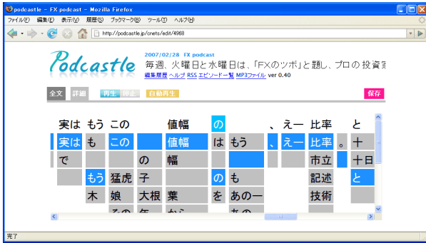
Figure 2: PodCastle screen snapshot of an interface for correcting speech recognition errors (competitive candidates are presented underneath the normal recognition results). Five errors in this excerpt were corrected by selecting from the candidates. The corrected Japanese sentence means “...well, actually the ratio of this price range and...”.

episodes at arbitrary intervals (daily, weekly, etc.). With RSS, updated episodes are automatically downloaded from the web and can be stored in any type of player. Podcasts are often referred to as audio blogs and their popularity has grown because anybody can publish and download audio data with ease. Just as full-text search services are essential for accessing text web pages, there is a growing need for full-text speech retrieval services such as PodCastle.