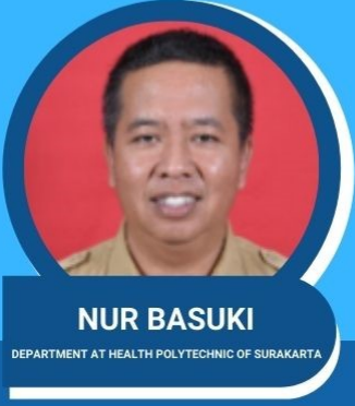
NUR BASUKI DEPARTMENT AT HEALTH POLYTECHNIC OF SURAKARTA