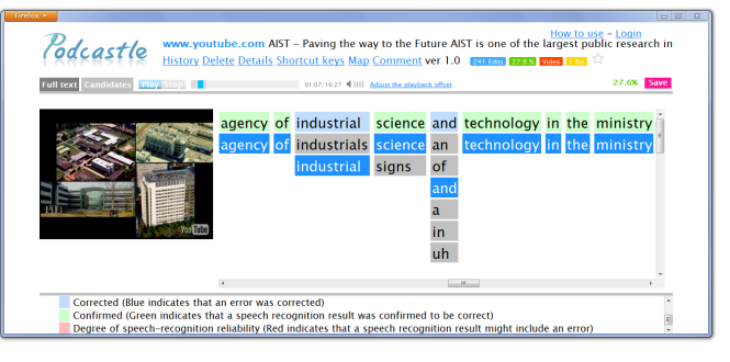
Figure 1: Screen snapshot of PodCastle's interface for correcting speech recognition errors. Competitive candidate alternatives are presented under the 1-best recognition results.

To improve the usefulness of this web service for end users, we have studied and developed several speech recognition methods to increase the accuracy of transcripts of the online spoken content [2]. Recent advances in state-of-the-art large vocabulary continuous speech recognition (LVCSR) systems can be attributed to the availability of large amounts of training data. In usual, these training data are collected for each specific task like broadcasting news, lectures, meetings, etc., and their accurate transcriptions are manually prepared. The most critical issue in transcribing online spoken content such as podcasts and video clips is that there is a wide variety of both linguistic content and acoustic conditions. A common approach of building a task-specific corpus in advance is impractical because it will be