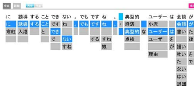
Figure 2: PodCastle screen snapshot of an interface for correcting speech recognition errors (competitive candidates are presented underneath the 1-best recognition results). Six errors in this excerpt were corrected by selecting from the candidates.

In transcribing speech data from a specific task, a single or several acoustic models can be trained on the speech data matched with each task (task-dependent acoustic models). However, in