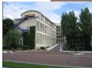
ENS de Cachan (Paris)