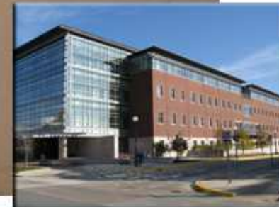
Univ of Illinois (Urbana-Champaign)